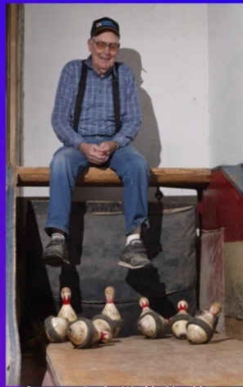
Burnette-Omaha World -Herald